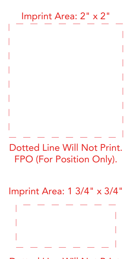
Dotted Line Will Not Print. FPO (For Position Only).